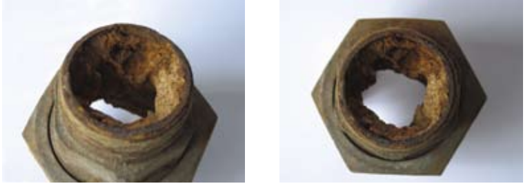
Biofilm formation on the inside of plumbing pipe connection

Experts in the field of antimicrobials say that the most effective way to prevent biofilm formation is to inhibit colonization and proliferation of bacteria, which is the primary mechanism by which antimicrobial silver combats biofilms.